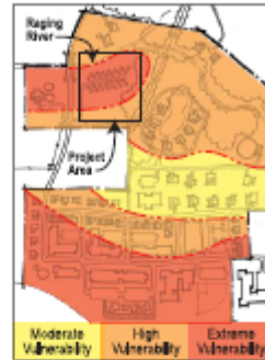
Town of Hazardville Composite Loss Map developed previously during risk assessment (see FEMA 386-2).

Losses avoided by acquisition and demolition of flood-prone structures