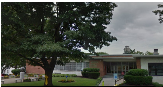
Saratoga County Clerk's Office (Street view), Ballston Spa

*The Saratoga County Clerk's Office has over 17 million documents digitized and available for viewing and printing on-line and in-house.