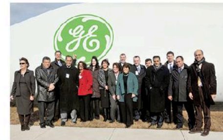
The International Center of the Capital Region has worked with area chambers of commerce for many years, including affiliates of the Capital Region Chamber. In this 2012 photo, the Chamber of Southern Saratoga County entertained representatives from eight Chambers of Commerce from Tunisia, pictured here standing in front of a GE turbine blade.

Achievement Awards event late this year, which will honor foreign-born community members who have made significant contributions to the Capital Region, and advanced cross-cultural dialogue. They are seeking nominees, and this opportunity has been extended through April 29, 2022, at 5pm. Awards will be given in the following categories: Business & Entrepreneurship, Civic Engagement & Citizenship, Community Service & Philanthropy, Distinguished Career, and a community member will be recognized who has shown outstanding commitment to citizen diplomacy as ICCR volunteer of the year. Please check out their website for more information or to make a nomination. And save the date: the 2022 Achievement Awards will take place on Saturday November 19th, 2022, from 5-8pm.