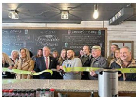
Ribbon Cutting at Irresistible Nutrition

Today, Waterford is perhaps a little quieter than it was in the days of tugboats, trains and trolley cars but it is still a place with an interesting culture and a proud history. The annual waterfront festivals (May, July, August, September) are exciting, regional attractions. New businesses are opening along its main thoroughfares. Hatchet Hardware (42 Saratoga Ave, (518) 233-1073, hatchethardware.com), for example, came to the so-called "north side" a few years ago, and has done well for that expanding family of stores despite the Pandemic. On Broad Street, the Village has dedicated a new Hall at 73 Broad Street (at the site of the former Maloney's Flower Shop), while new places to find food are springing up all over. This past Wednesday, a walk-through was conducted in the Village, celebrating openings and milestones at several locations.