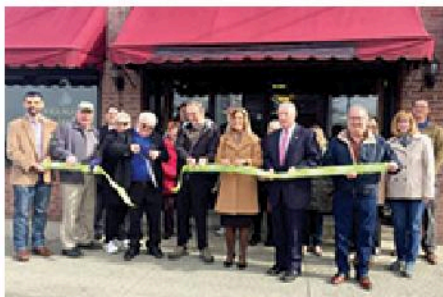
Ribbon Cutting at Waterford Village Hall