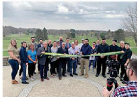
The enthusiastic ribbon cutting for the Cooley Kill Restaurant & Bar, done in front of the majestic course at the Van Patten Golf Club.