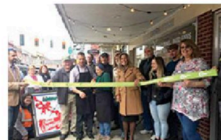
Ribbon cutting at Ze Cuisine & Cafe

The day's events showcased the spirit of community and served as a reminder why Saratoga County and the surrounding Capital Region are some of the best places in the entire state to live, play, and work! All 2022 ribbon cuttings of the Capital Region Chamber and its affiliates are sponsored by the Saratoga National Bank and Trust Company.