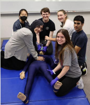
Saratoga County EMT Career Pathway Pilot Program Students