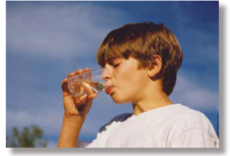
Clean water is an economic benefit of a healthy ecosystem.

The county has enjoyed the benefits of abundant and healthy natural resources—"green infrastructure." This green infrastructure is as important to our health and well being as our system of grey infrastructure. These green assets provide clean air and water. They maintain functioning natural systems that reduce the impacts of flooding and erosion and provide many other significant environmental benefits. They help to sustain important economic, scenic, historic and recreational landscapes that attract residents and visitors to live, work, shop and recreate